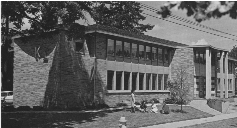
Sale of the former Kappa Sigma chapter house at 1090 Alder St., Eugene, provided the initial capital for our new Gamma-Alpha Educational Foundation.